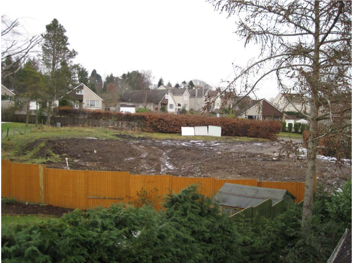
Picture 3 What is left from the site pictured above.