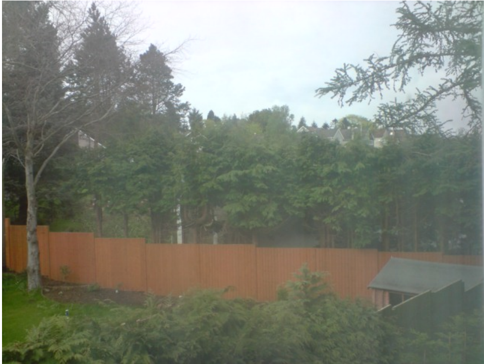
Picture 2 above original view and amenity from 3 Baillieswells Drive